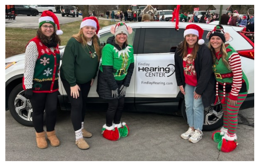
Home for the Holidays Parade